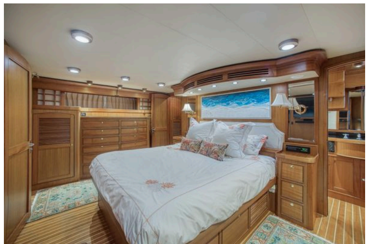
Luxurious Marlow 78E 2009 yacht bedroom with elegant wood finish and cozy bedding.