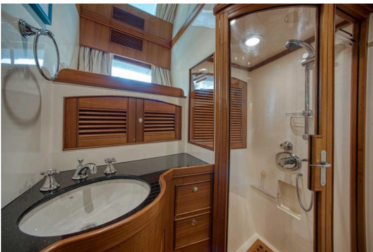
Luxurious Marlow 78E 2009 yacht bathroom with wood accents and modern shower.