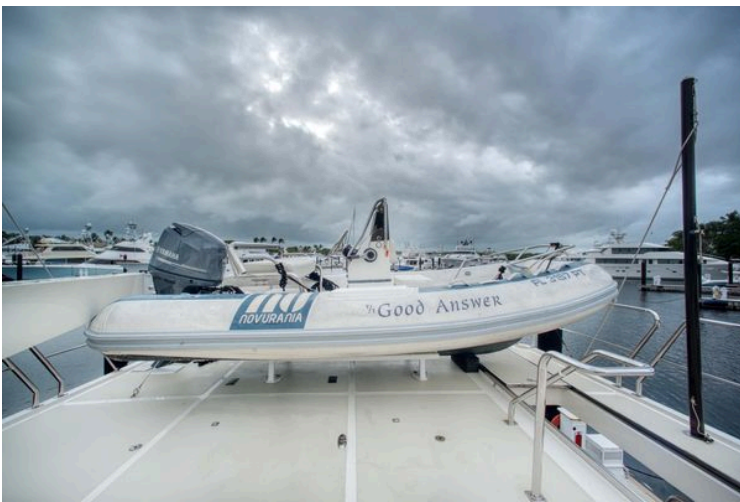
RIB boat "Good Answer" on Marlow 78E yacht, cloudy marina backdrop.