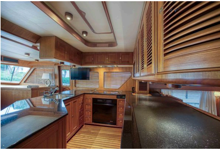
Luxurious wooden interior of 2009 Marlow 78E yacht kitchen with modern amenities.