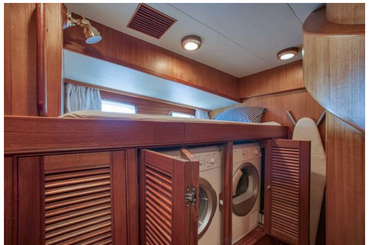
Laundry area with washer and dryer in 2009 Marlow 78E yacht cabin.