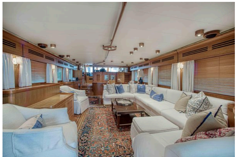
Luxurious interior of 2009 Marlow 78E yacht with elegant seating and decor.