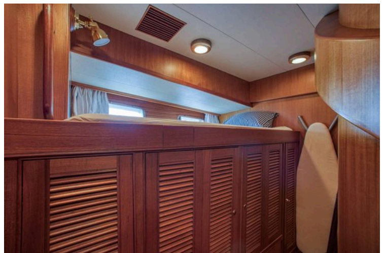
Luxurious wooden cabin interior of 2009 Marlow 78E yacht with bed and storage.