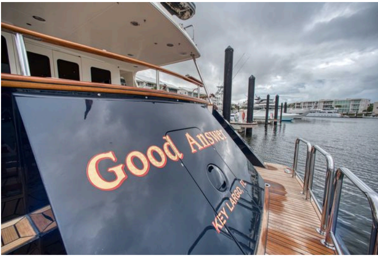
2009 Marlow 78E yacht "Good Answer" docked at marina, Key Largo.