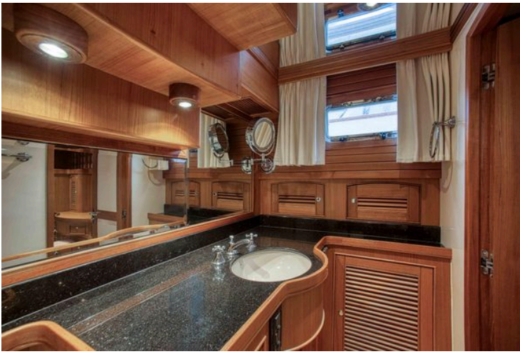
Luxurious wooden bathroom interior on 2009 Marlow 78E yacht with elegant fixtures.