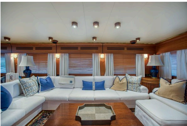
Luxurious interior of 2009 Marlow 78E yacht with elegant white seating and decorative pillows.