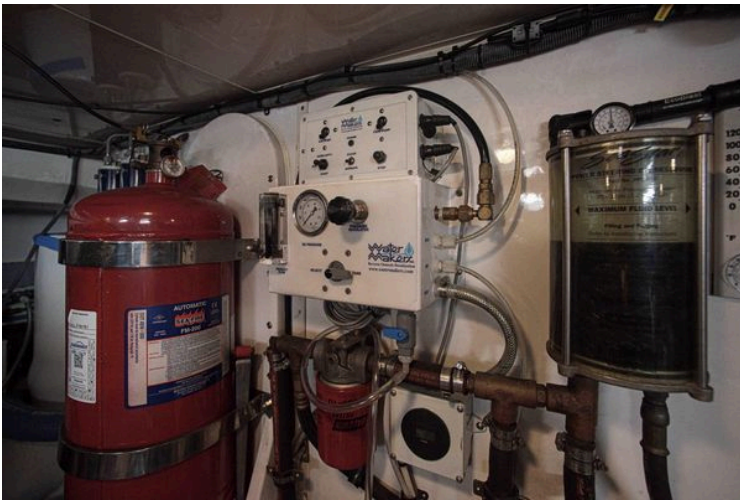
Engine room of 2009 Marlow 78E yacht with fire suppression and water filtration systems.