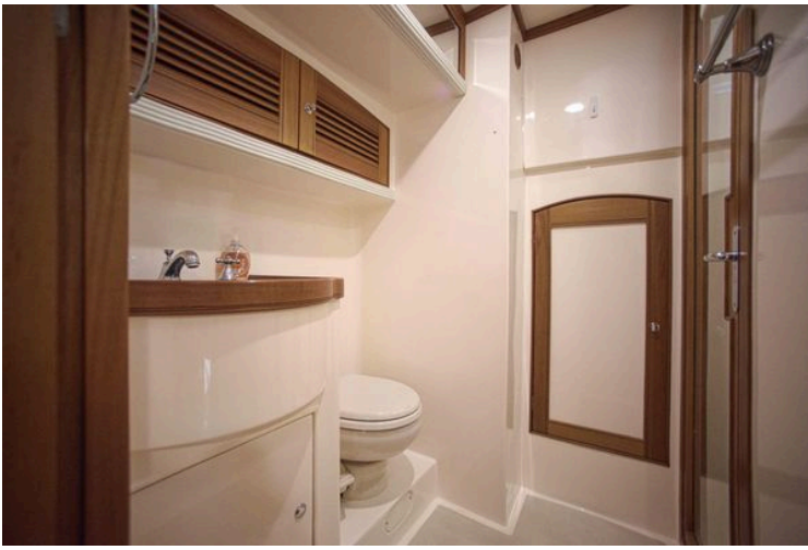
Luxurious Marlow 78E 2009 yacht bathroom with wood accents and modern fixtures.