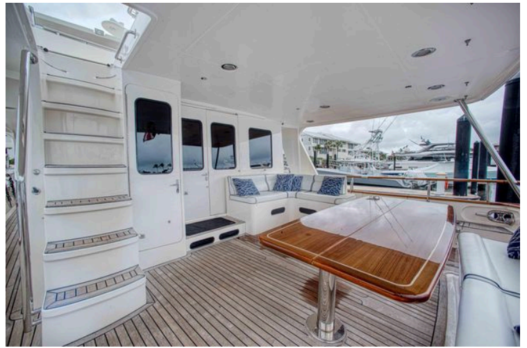
Luxurious 2009 Marlow 78E yacht deck with seating, table, and staircase.