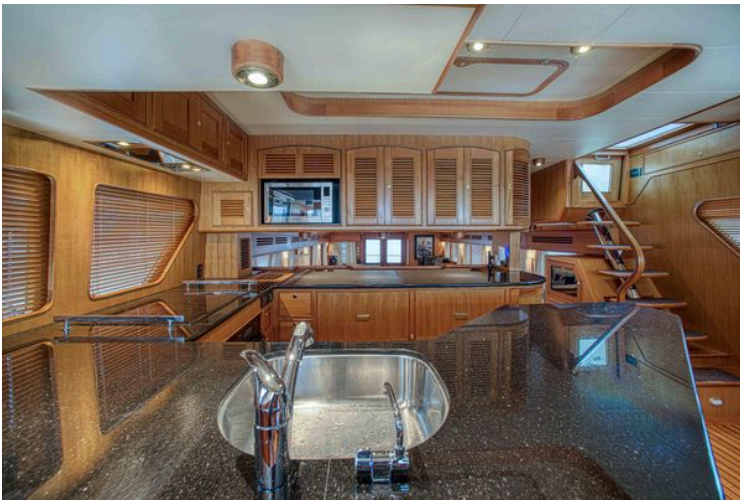
Luxurious kitchen interior of 2009 Marlow 78E yacht with modern amenities and wooden finishes.