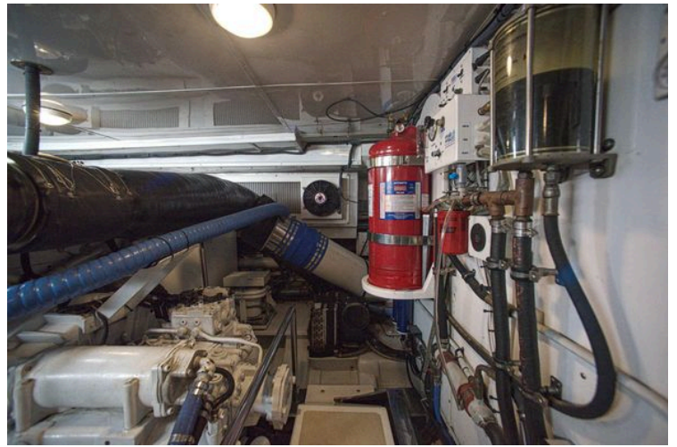
Engine room of 2009 Marlow 78E yacht with fire extinguisher and mechanical components.