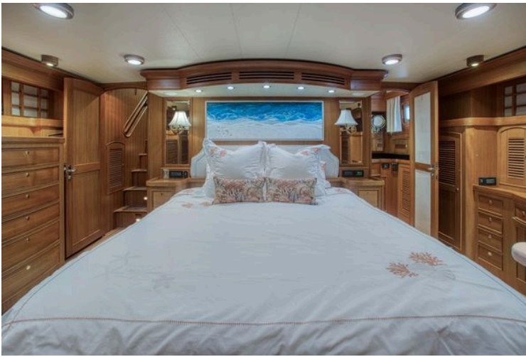
Luxurious bedroom interior of 2009 Marlow 78E yacht with elegant wood finishes.