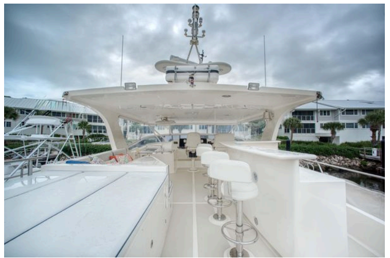
Luxurious 2009 Marlow 78E yacht deck with seating and bar stools, docked near waterfront homes.