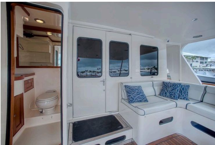
Luxury yacht Marlow 78E 2009 interior with seating and bathroom.