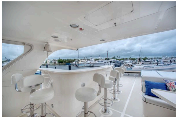
Luxurious 2009 Marlow 78E yacht with elegant bar and seating area, docked at marina.