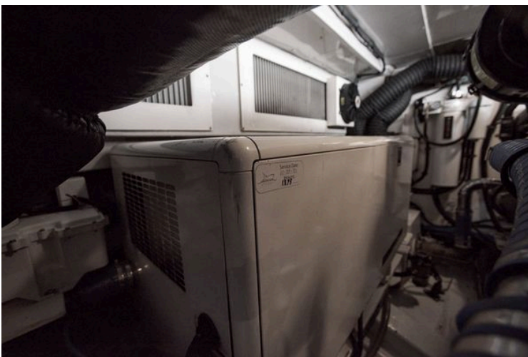
Engine room of 2009 Marlow 78E yacht with visible machinery and ventilation.