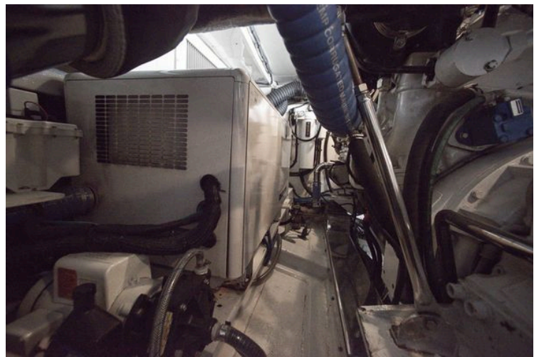
Engine room of 2009 Marlow 78E yacht with complex machinery and cables.