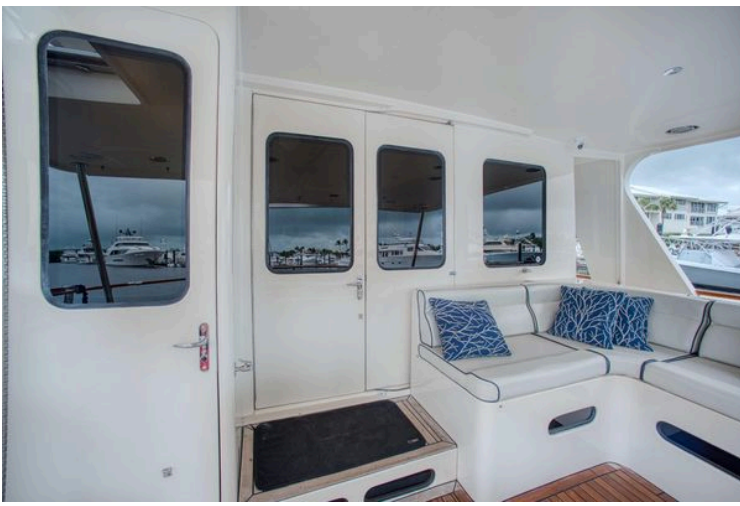
2009 Marlow 78E yacht interior with cushioned seating and decorative pillows.