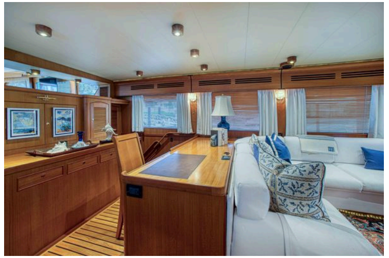
Luxurious interior of 2009 Marlow 78E yacht with elegant wood finishes and plush seating.