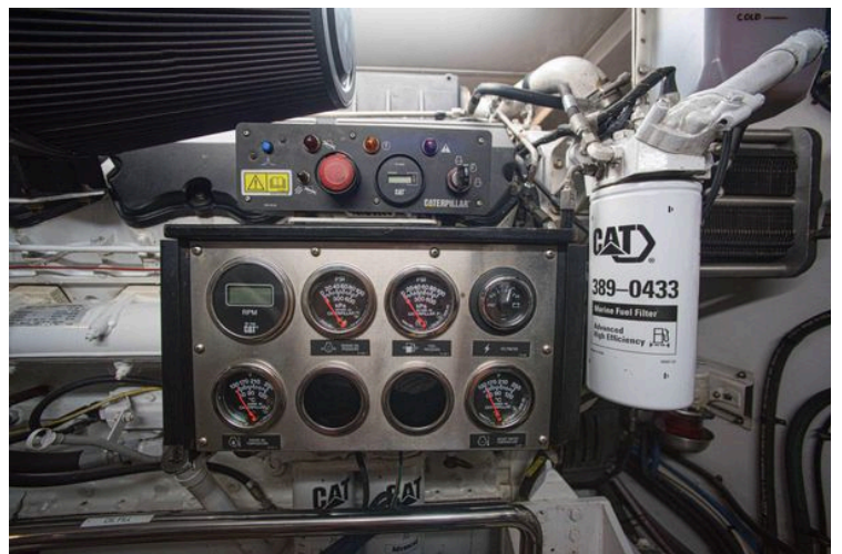
Engine control panel of 2009 Marlow 78E yacht with gauges and CAT marine fuel filter.