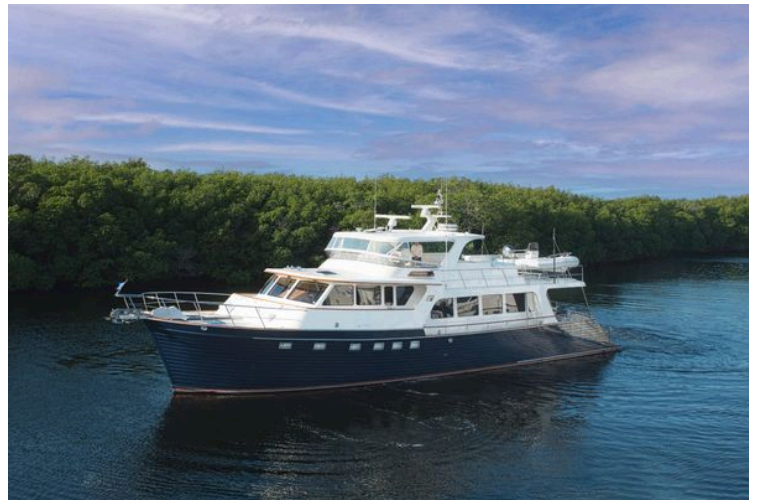
Luxurious 2009 Marlow 78E yacht cruising on calm waters near lush greenery.