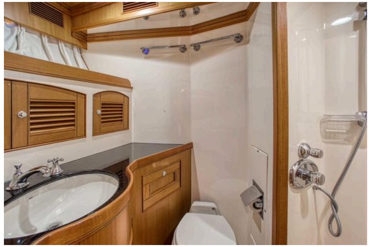
Luxurious 2009 Marlow 78E yacht bathroom with wood accents and modern fixtures.