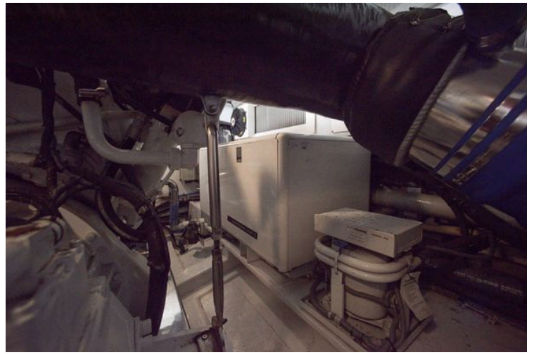
Engine room of 2009 Marlow 78E yacht with visible machinery and equipment.