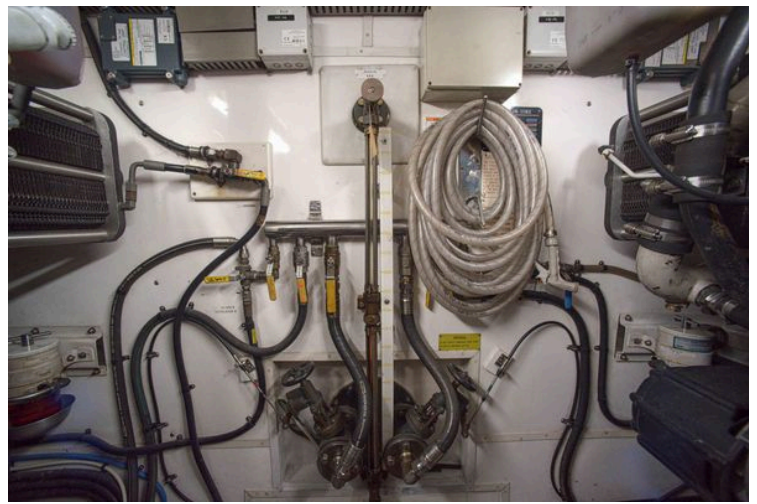
Engine room of 2009 Marlow 78E yacht with hoses and mechanical components.