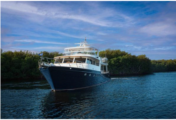
Luxurious 2009 Marlow 78E yacht cruising on a serene waterway.