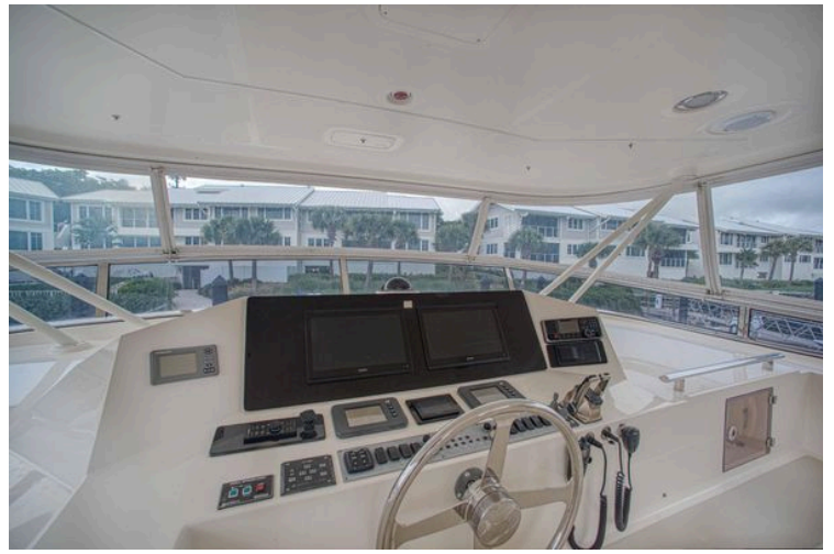
Helm of 2009 Marlow 78E yacht with navigation equipment and steering wheel.