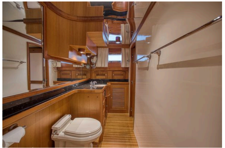
Luxurious Marlow 78E 2009 yacht bathroom with wood accents and modern fixtures.