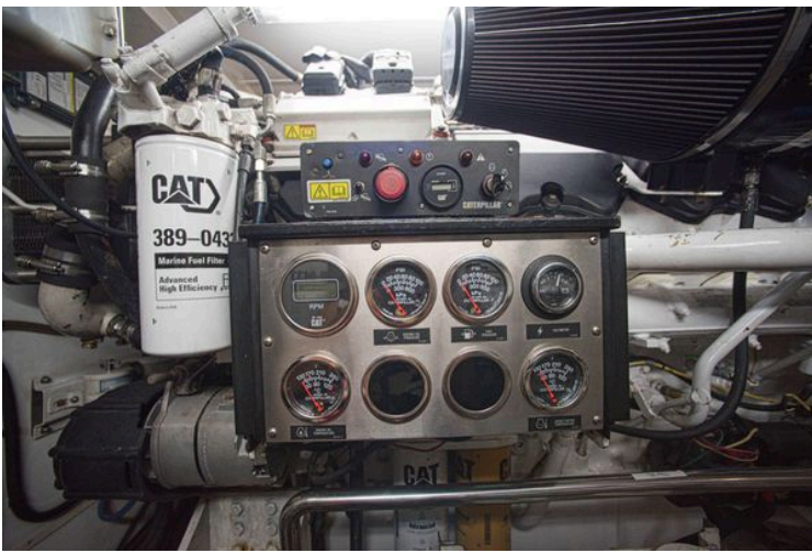
Engine control panel of a 2009 Marlow 78E yacht with CAT marine fuel filter.