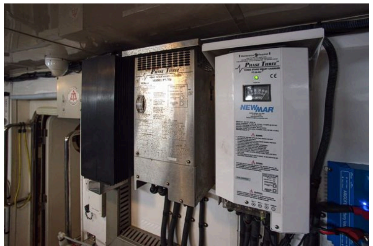
Electrical equipment in a 2009 Marlow 78E yacht engine room, featuring a Newmar smart charger.