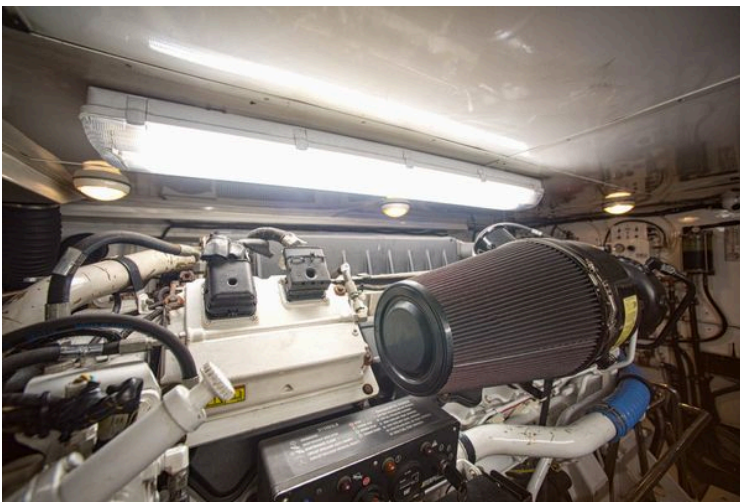
Engine room of 2009 Marlow 78E yacht, featuring mechanical components and lighting.