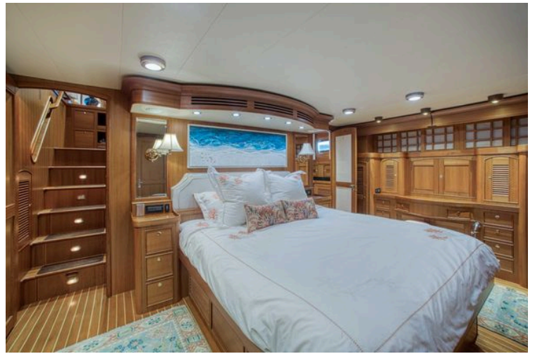
Luxurious bedroom interior of 2009 Marlow 78E yacht with elegant wood finishes and cozy bedding.