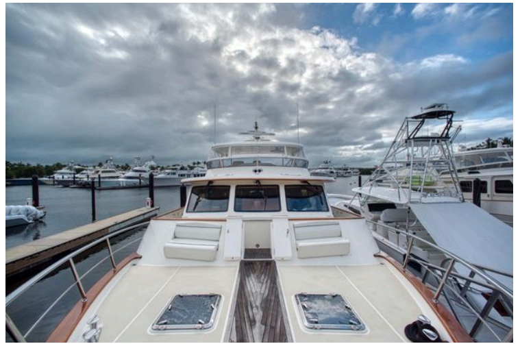
2009 Marlow 78E yacht docked at marina under cloudy sky.