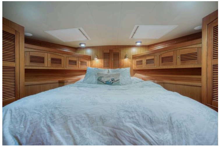
Luxurious cabin interior of 2009 Marlow 78E yacht with wooden accents and cozy bedding.