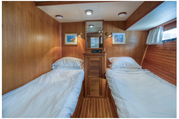
Cozy twin cabin with wooden interior on 2009 Marlow 78E yacht.