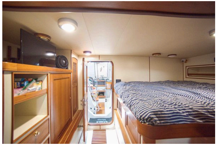
Interior of 2009 Marlow 78E yacht cabin with bed, TV, and wooden storage.