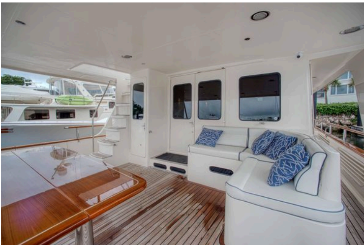
Luxurious 2009 Marlow 78E yacht deck with elegant seating and wooden table.