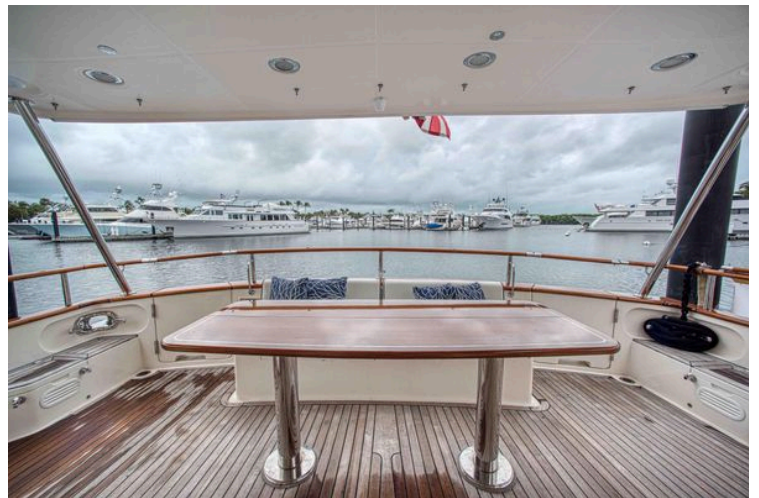
Luxury yacht deck view, Marlow 78E, 2009 model, overlooking marina with moored boats.