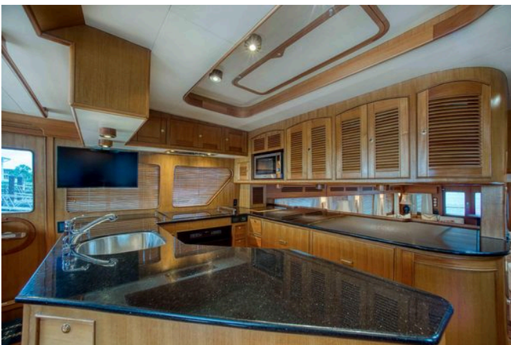
Luxurious kitchen interior of 2009 Marlow 78E yacht with wooden cabinets and modern appliances.