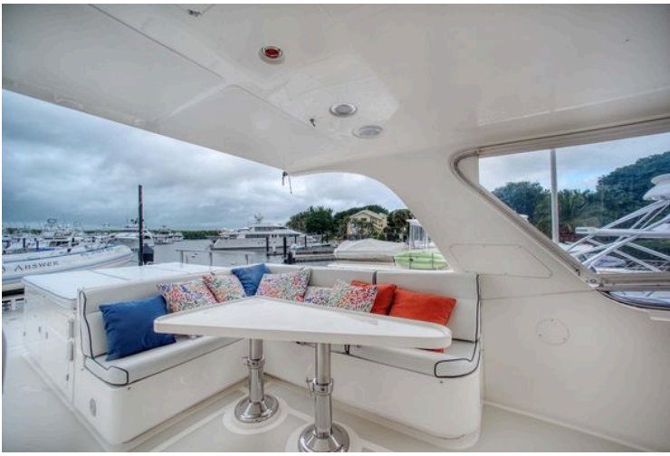
Luxurious 2009 Marlow 78E yacht deck with cushioned seating and vibrant pillows.