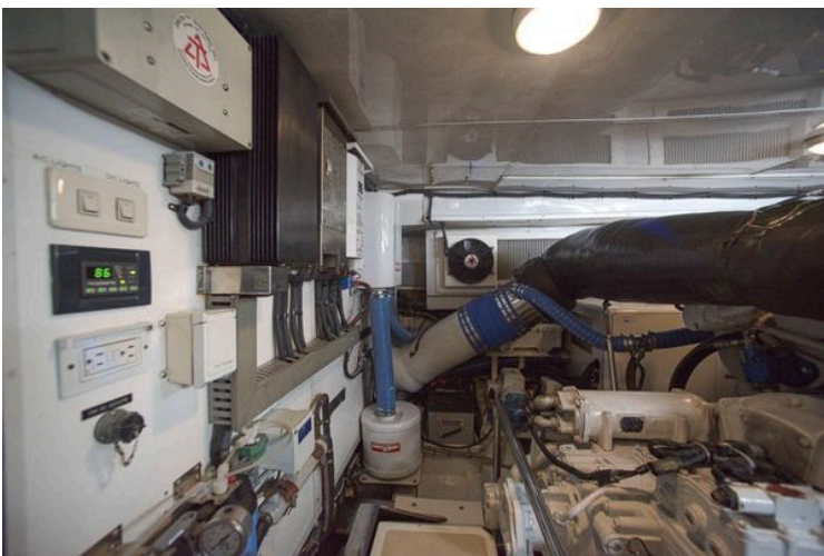
Engine room of 2009 Marlow 78E yacht with control panels and ventilation system.