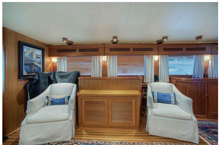
Luxurious interior of 2009 Marlow 78E yacht with elegant seating and nautical decor.