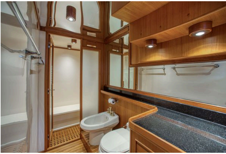
Luxurious Marlow 78E 2009 yacht bathroom with wood accents and modern fixtures.