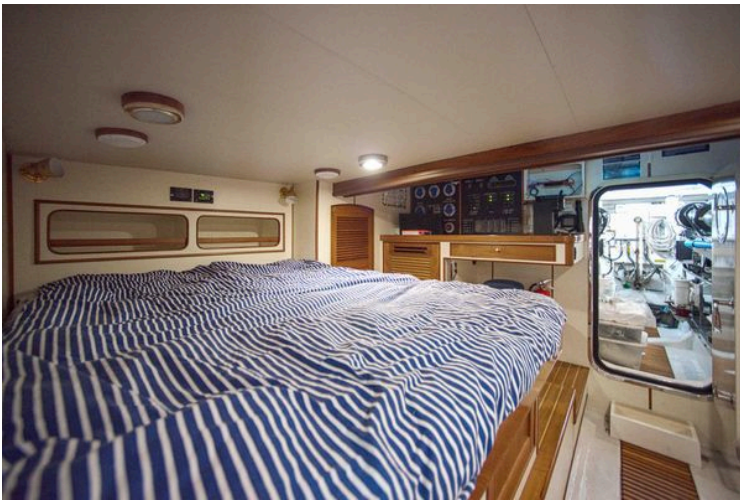
Cozy cabin interior of 2009 Marlow 78E yacht with striped bedding and control panels.