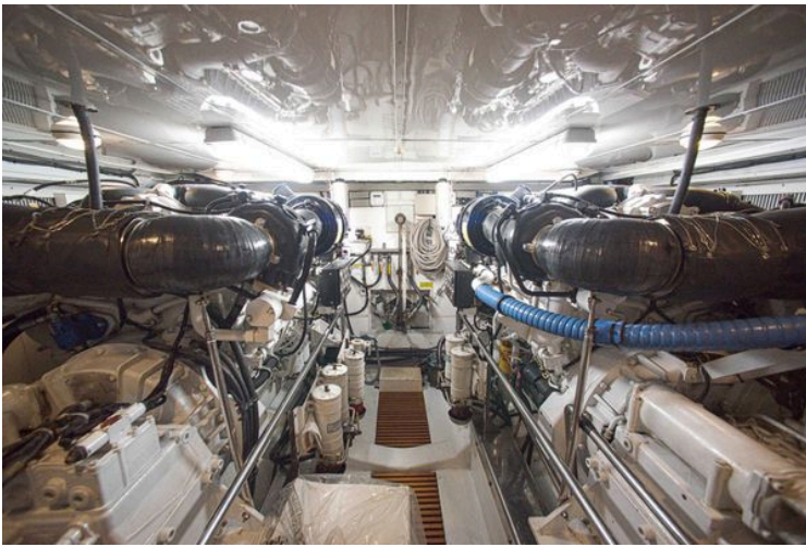
Engine room of a 2009 Marlow 78E yacht, featuring dual engines and mechanical equipment.